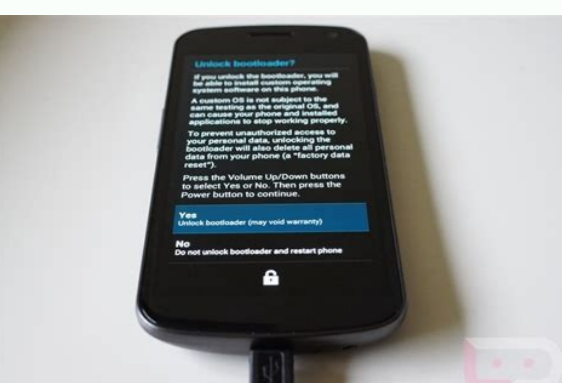
How to turn on nexus 7 without power button. Nexus 7 reset button.